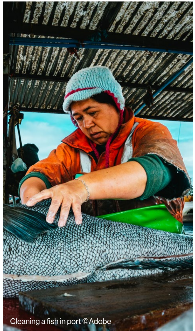
Cleaning a fish in port

The global PFP community is powered by Indigenous peoples and community representatives working with government agencies and local partners to shape country-led visions for durable conservation that can be scaled and replicated. Today, we collaborate with more than 150 local partners, honoring local context and complexity while advancing ecological integrity and community well-being, supported by catalytic partners such as the Bezos Earth Fund, the Global Environment Facility, the Gordon and Betty Moore Foundation, the Green Climate Fund, Margaret A. Cargill Philanthropies, the Wyss Foundation, and others who help demonstrate the impact of durable finance combined with local leadership.